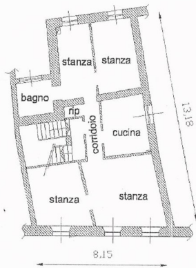
PRIMO PIANO H. MT. 2.95